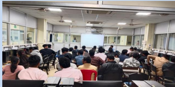
Central Tool Room & Training Centre, Bhubaneswar