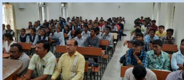
SRR Government Arts & Science College, Karimnagar