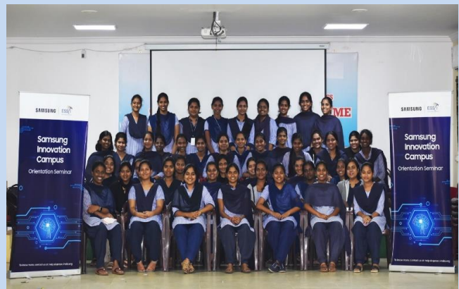
Lankapalli Bullayya College, Visakhapatnam