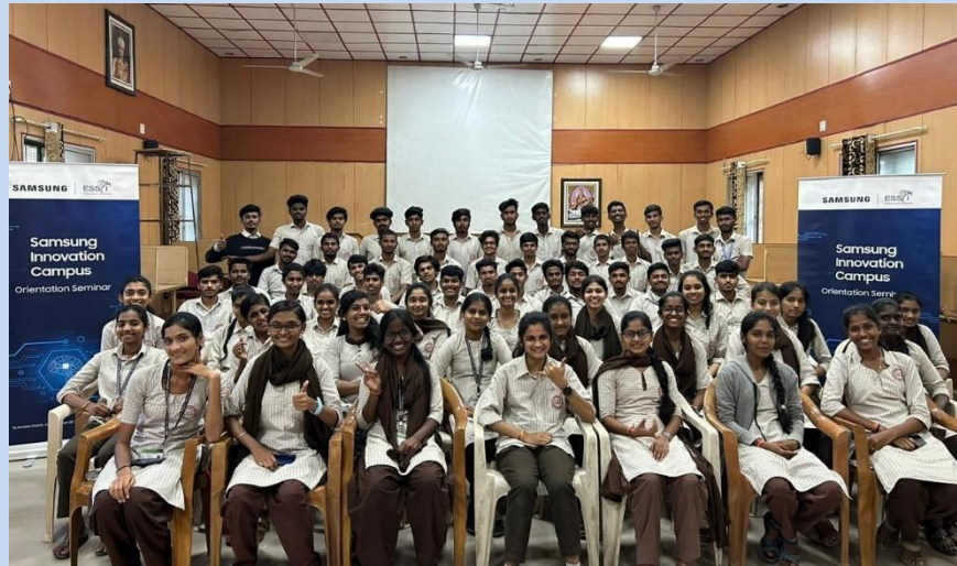
SJP College, Bangalore