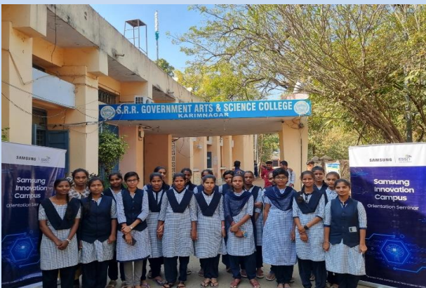
SRR Karimnagar, Telangana

Training Programme for AI, IoT & BD will be completed by capstone project & Hackathon for Coding & Programming. Raspberry Pi kits, Samsung Galaxy Upcycling Kit distributed across the Centers for IoT Courses and Giveaway Kits (SIC T-shirts & Bags) are distributed to all participants across the eight centers.