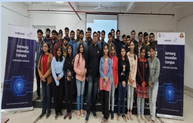
Lucknow University, Lucknow