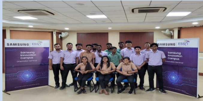
Central Tool Room & Training Centre (CTTC), Bhubaneswar