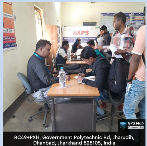
RC49+PXH, Government Polytechnic Rd, Jharudih, Dhanbad, Jharkhand 828105, India